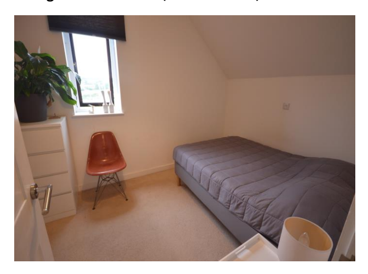
Garage 33' 11" x 16' 4" (10.33m x 4.97m)

A large garage with a concrete floor, fluorescent lighting and plenty of power points and double doors with a 9'/2.74m width. This is an ideal workshop or classic car garage. Attached to one side at the front of the garage with its own exterior door is a bin store (5'4" \times 4'2"/1.62m \times 1.26m)